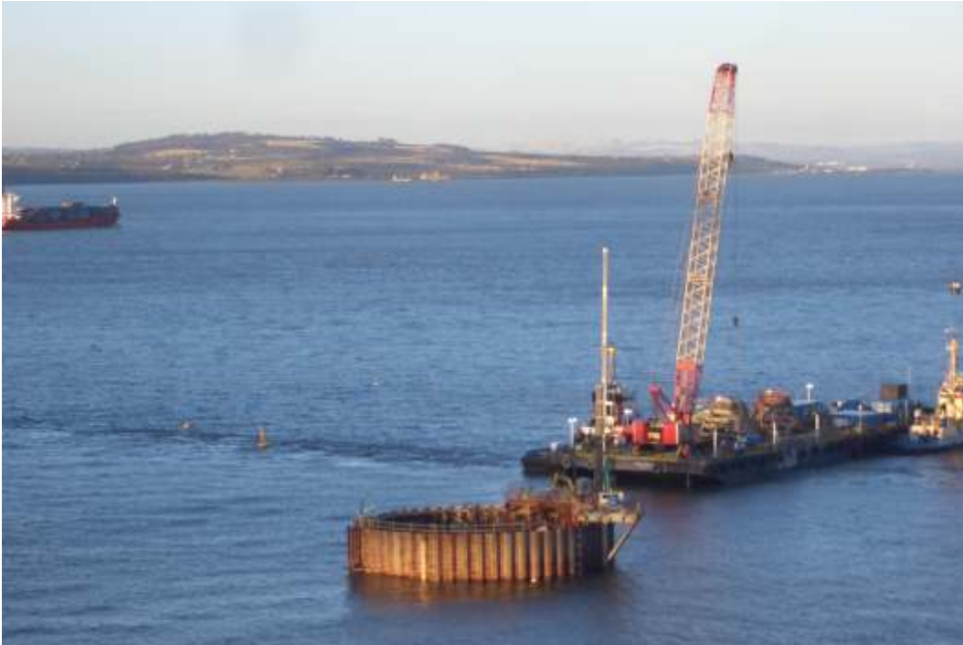
Drill rig on north tower with service barge