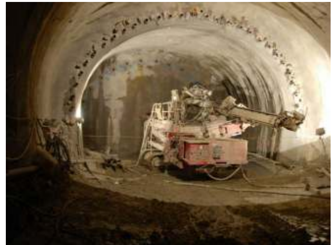
RODIO SR510 drill rig inside the Lot 1300 tunnels